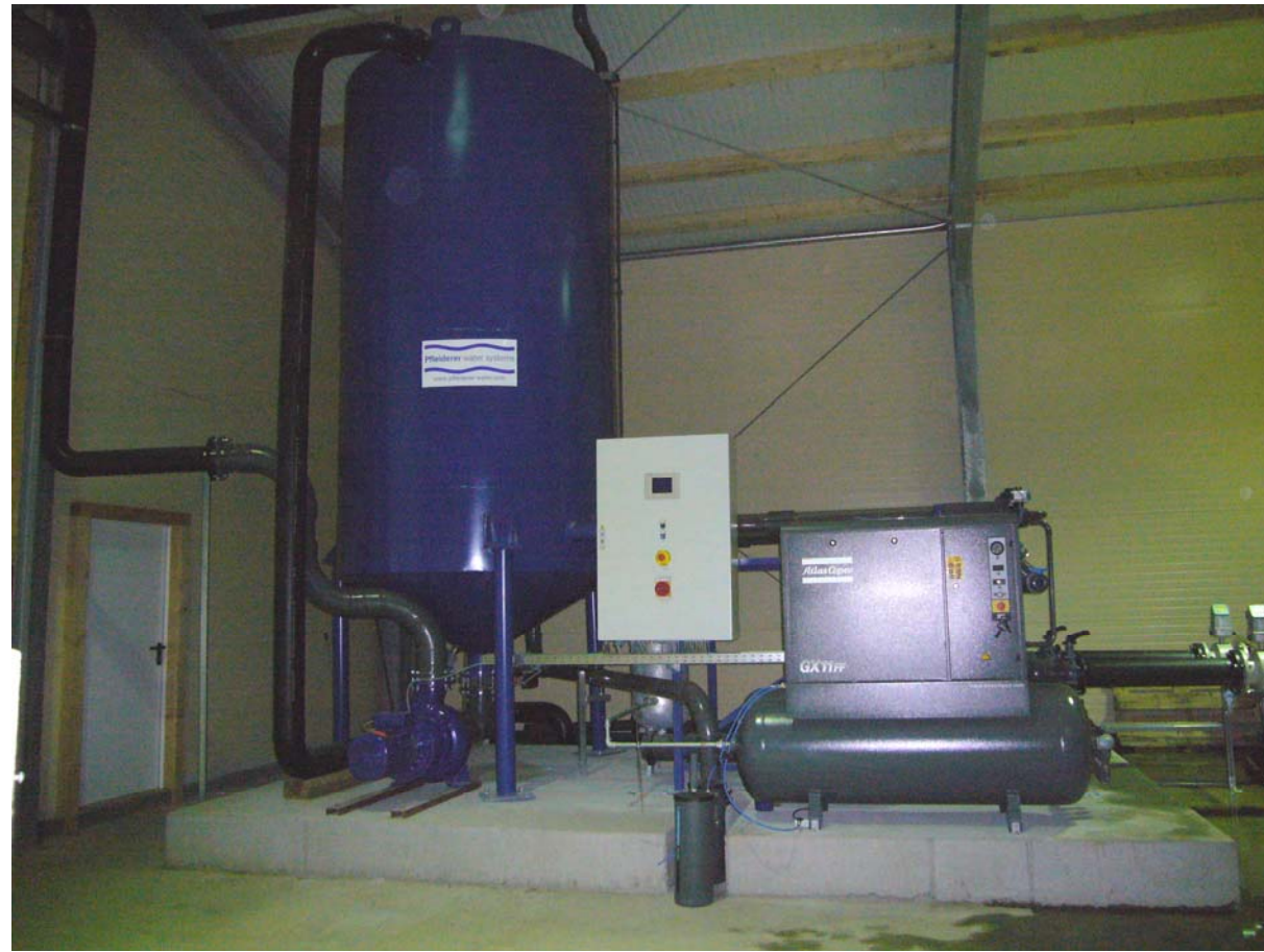
Abbildung 2: Filteranlage Newfilt 90m 3 /h