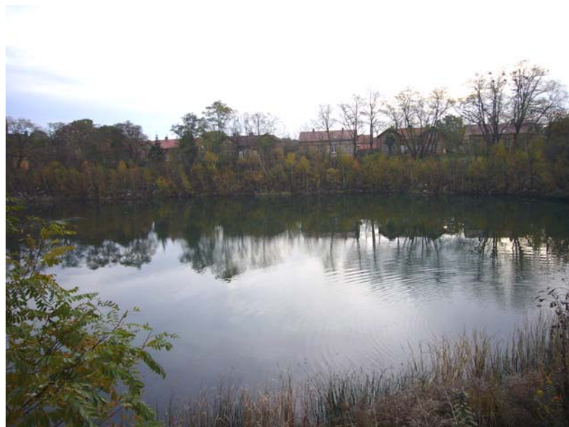
Abbildung 3: belastetes Restloch 4